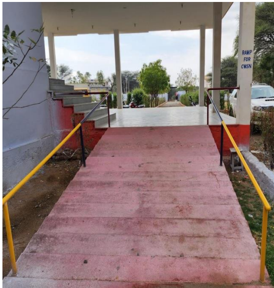
Ramp For CWSN

1. The school does not have separate toilets for CWSN, boys and girls. A ramp is seen at the entrance but it is without handrails and dangerous for CWSN.