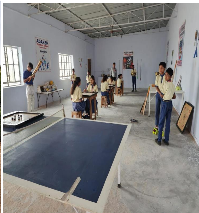
Indoor Sports Room